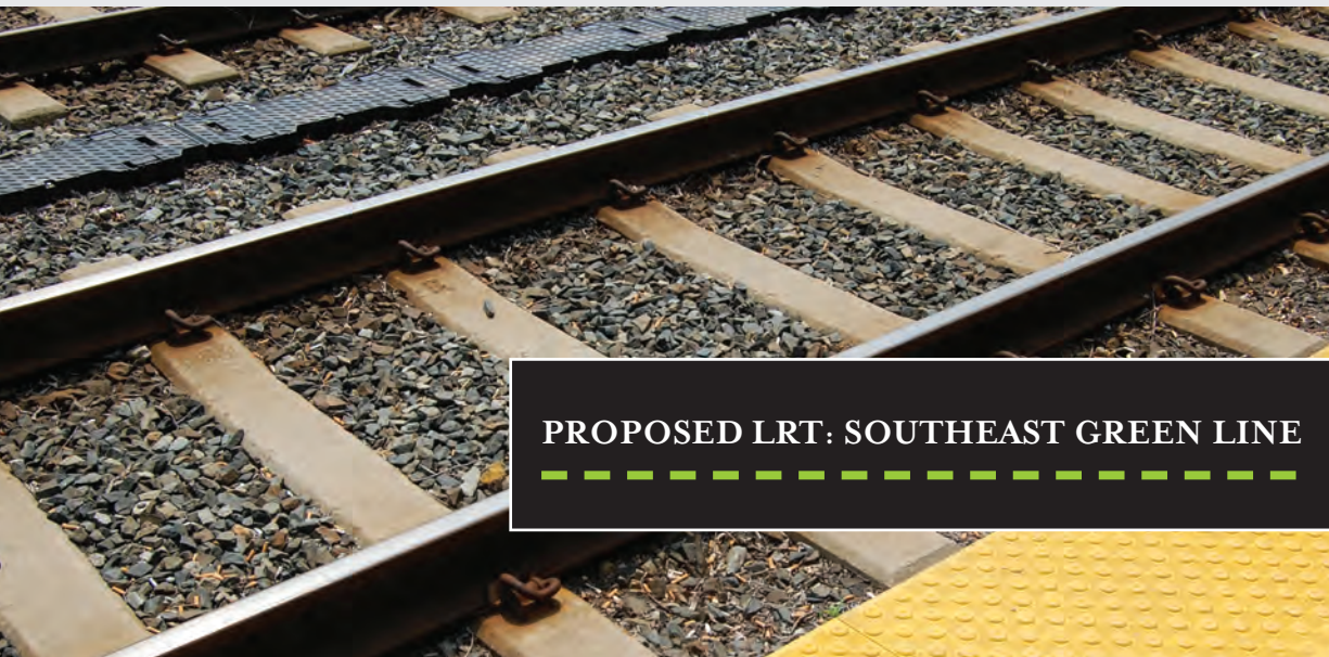
PROPOSED LRT: SOUTHEAST GREEN LINE

The Green Line Southeast Transitway is 26km and includes 15 new transit stations. One of those stations will be situated right here in Quarry Park at 24th Street and Quarry Park Boulevard. The first stage of construction is expected to commence in 2017 and will involve construction from 4th Street Southeast in the City's core to Douglas Glen. Initially, the Greenline was initially planned to be constructed over a +/- 30 year period starting as a bus-only transitway and then later converting to LRT. However, the July 24th announcement by the Federal government means that Calgarians will benefit from fast and more reliable light rail transit ahead of schedule. For more information, visit the City of Calgary website and search 'Green Line.'