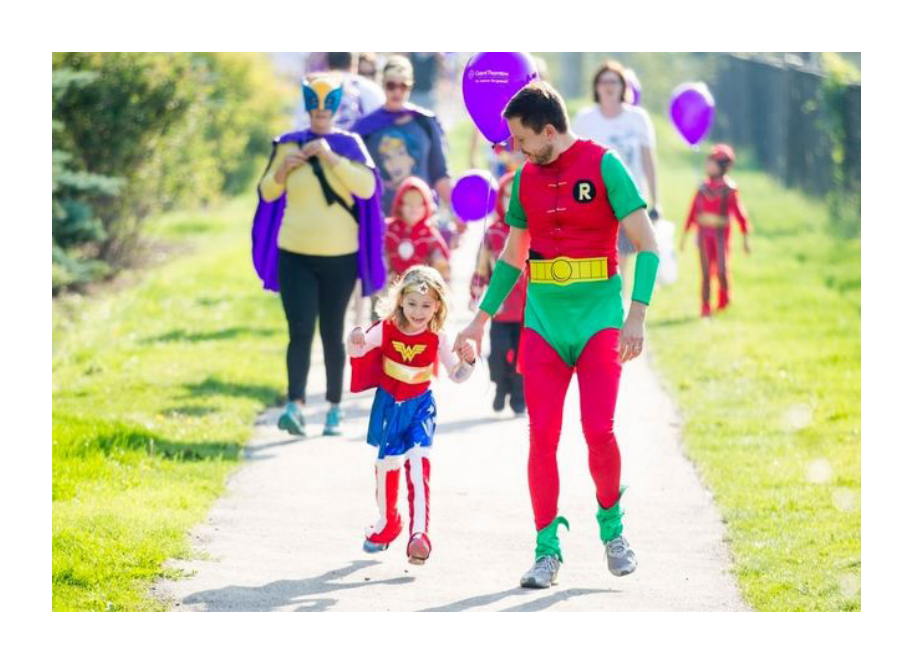
Saturday, June 17, 2023 9:00am – Noon Remington Development Corporation parking lot (200 Quarry Park Blvd SE)

Suit up and get ready for Race for Pace! For over a decade, heroes across Calgary have laced up and embraced their inner hero in support of Pacekids Programs. This superhero-themed fun run and walk is a family-friendly morning filled with exciting activities, great prizing and awards, and sensory friendly spaces. All proceeds raised will directly support Pacekids and provide critical programs and services to over 600 children and families this year. Pacekids empowers children with disabilities and diverse needs through excellence in therapy, education, and play.